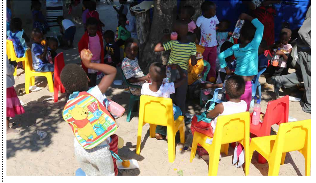
Pictured: Children at the Masida ECD Centre in the Linvanti Constituency