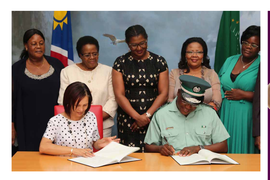
Pictured: First Lady Monica Geingos, Former First Lady Penehupifo Pohamba and Line Ministers witness the signing of MOU between The Office of the Fist Lady and the Namibia Correctional Service

The ONE Economy Foundation (ONE) very quickly learnt that the best the most genuine way to complement the work of existing organisations is by forging smart partnership. Since our inception we have managed to gather more than 80 agencies and disciplines in scoping meetings and mapping workshops to strengthen the coordination of our mutual efforts and create awareness about what other stakeholders are doing and maximise synergies and outcomes.