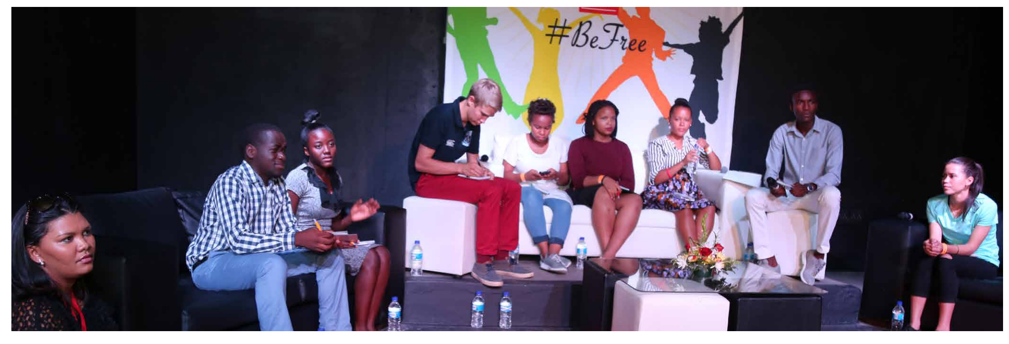
Pictured: Young people express their views on the chalenges of adolescence at the launch of the #BeFree Movement, Club London - Windhoek