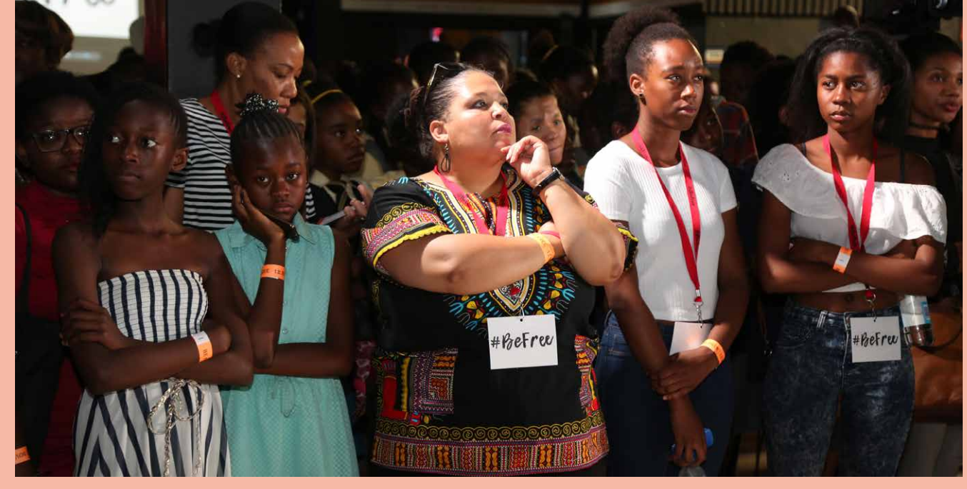
Pictured: #BeFree volunteers

reward. We remain cognizant of our capacity constraints The volunteer programme is open to everyone. If this is but we draw our inspiration from every individual or corporate who shares our ideals and believes we can bridge the gap between the first and second economy.